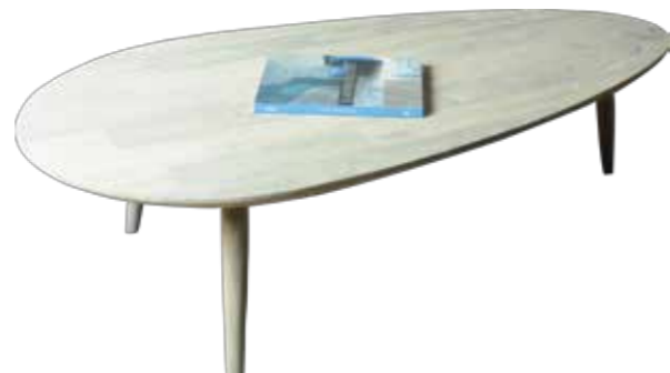
Oslo egg coffee table

Natural timber with exposed grain and a light weathered grey finish