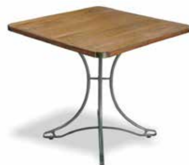
Re-engineered dining table