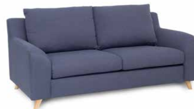
Lewis 3 seater

Choose from our quality selection of fabrics with a varying range of colours and textures to suit your personal interior style