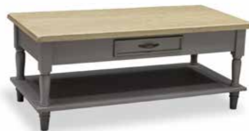
Storm grey coffee table

Dark storm grey paint is paired with a pale sand coloured top