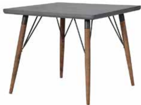
Small grey square dining table