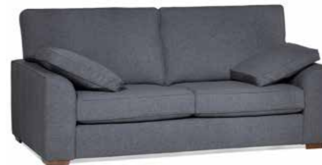
Brooke 3 seater

Choose from our quality selection of fabrics with a varying range of colours and textures to suit your personal interior style