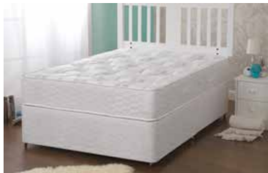
Divan Double bed

Double divan with choice of headboard colours from below