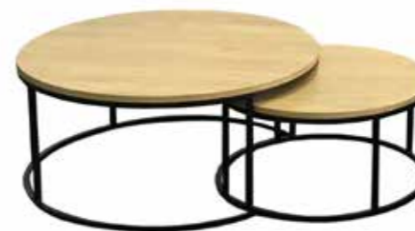
Round lacquer coffee table