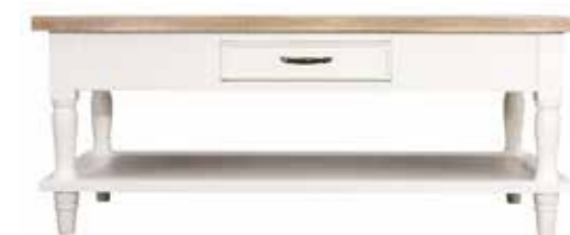
Cottonwood coffee table

Combines neutral paint colours with whitewashed roughsawn top