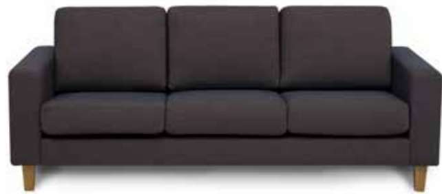
Dalton 3 seater

Choose from our quality selection of fabrics with a varying range of colours and textures to suit your personal interior style