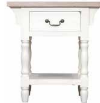
Cottonwood bedside table

Combines neutral paint colours with whitewashed roughsawn top