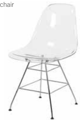
Clear perspex dining chair