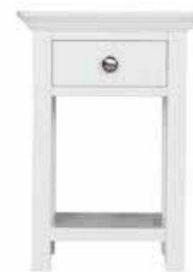
Open bedside table