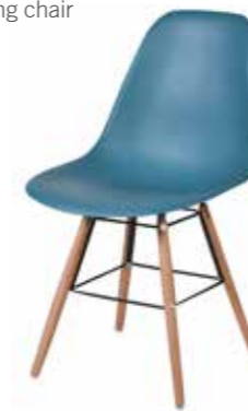
Teal moulded dining chair