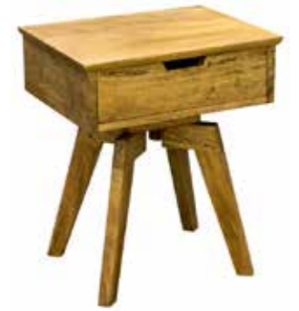
Mid Century bedside table