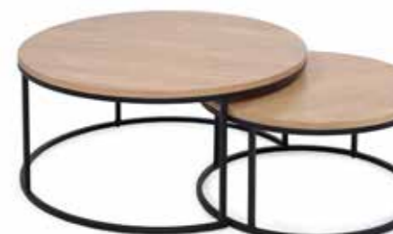
Round provence coffee table