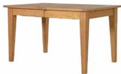
Brooklyn Oak square dining table