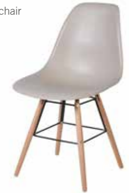
Nude moulded dining chair