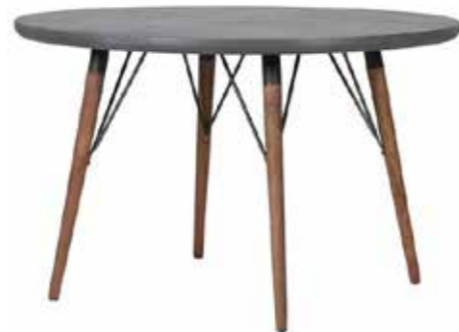
Small grey round dining table