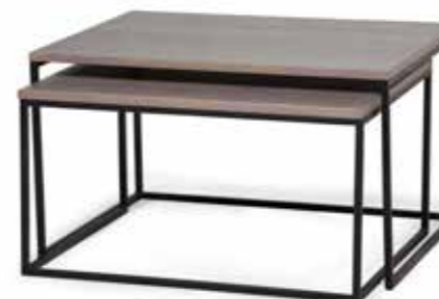
Rectangular lacquer coffee table