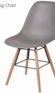
Mocha moulded dining chair