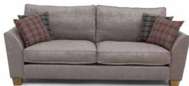
Devon 3 seater

Choose from our quality selection of fabrics with a varying range of colours and textures to suit your personal interior style