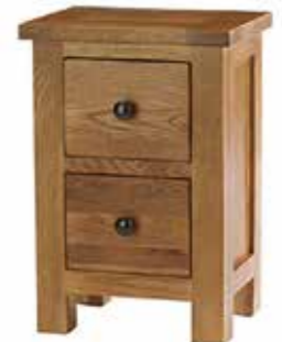
2 drawer bedside table