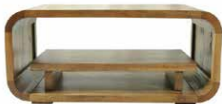
Mango coffee table

Made from sustainable mango with a natural wood finish