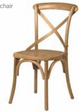
Gainsborough X back chair