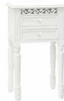
Belgravia bedside table