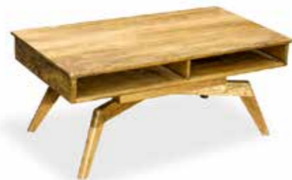
Mid Century coffee table