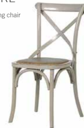
Hampshire X back chair