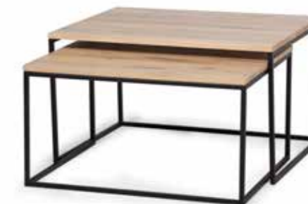
Rectangular provence coffee table