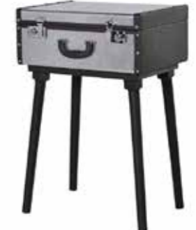
Silver suitcase bedside table